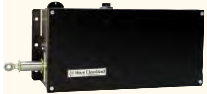
Hays Cleveland Model R-09500-B0 Draft Regulator

All models offer a linear damper drive with 6-inch range of travel, and 30 or 60 second nominal stroke time (providing 75 or 150 pounds starting thrust range, respectively). A powerful 72 RPM impedance-protected synchronous stepping motor positions a drive tube over a linear range of travel. Inward and outward end switches shut off power to the motor whenever the drive tube reaches the fully extended or fully retracted position. On sequencing models, an additional switch signals the burner management system that the damper is open, as required by codes. There is no hunting or overheating under even the most unstable process conditions.