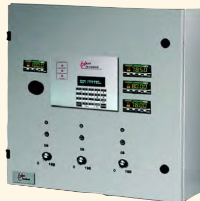
TYPICAL 3-BOILER MICRO IV™